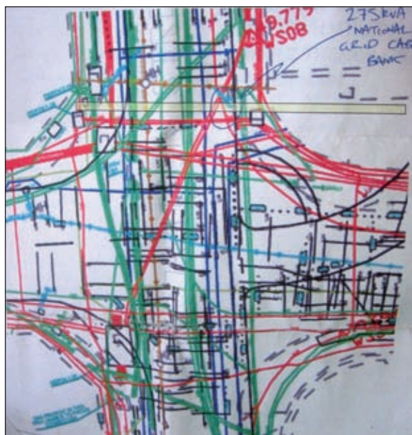
Utility plan for a highway improvement scheme – or an underground labyrinth?