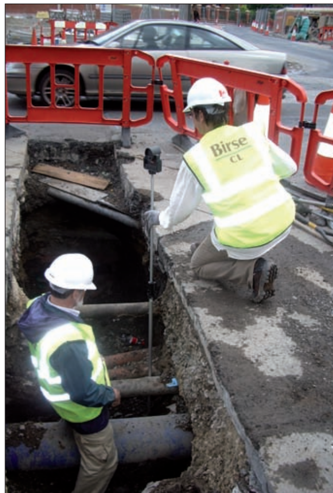
VISTA team members surveying buried utility assets.