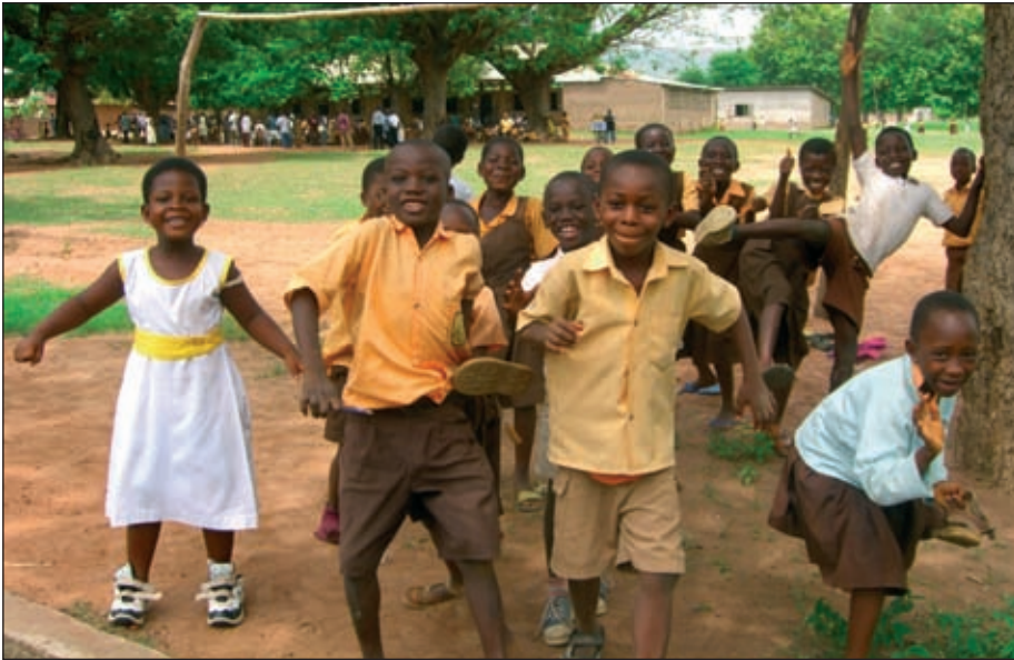
The agenda for FIG is to make a better world to our children.

ing the society. However, the saying “no news is good news” often applies in this regard. If the basic land administration infrastructure and the economy in the country are developing well and if surveyors are the key profession behind a well functioning real estate system and land markets, what more can be asked? For a single profession this is great achievement. On the other hand, in countries in transition where the land issues are changing the role of surveyors is much more visible. The same applies to countries where surveyors are actively involved in land use planning and land development. In general, it is of course important that the surveying profession, through their national associations and through regional institutions, try to influence government and thereby improve the position the surveying profession. FIG strongly supports such efforts such national and regional efforts.