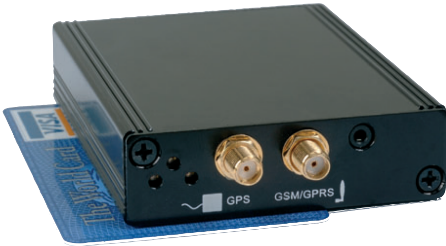
TraceMe needs 5,5 Volt to be operational, and can work on a solar panel.

motion detector, tilt sensor, et cetera. An accuracy of 10 to 20 meters can be achieved and in an altitude of 5,000 meters is no problem, as KCS found out when they sponsored Reach for the Sky Limited, an English hot air balloon firm taking part in the Filzmoos (Austria) Hot Air Balloon Week in January 2006. Though the device was exposed to both cold (because of the height) and heat (the flame for warming the air in the balloon), it didn't show any effects. The very mountainous environment was no problem for transmitting the exact location, height, speed and direction of the balloon. This enabled the ground crew to closely follow the flown route and even to be at the landing spot in time instead of the usual five hours after landing.