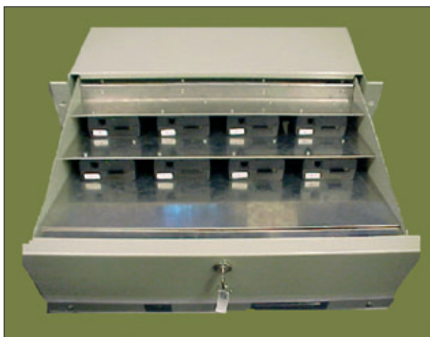
Figure 1, the GSM box.