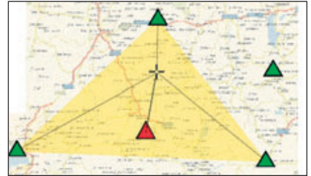
Figure 3, automatic cell.

In terms of technique and network calculations, this variation, see Figure 3, is comparable to the fixed cell. The major difference is that the cell is not pre-determined. This variation is recommended for users whose work area frequently changes.