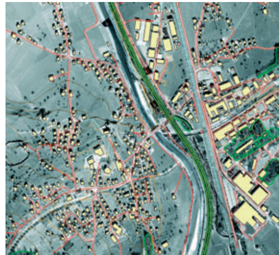
The Feature Analyst extension has been produced in collaboration with Visual Learning Systems (VLS). This aerial image of the Altdorf area in Switzerland shows the vectors defining roads, buildings, etc. that have been extracted using Feature Analyst.

In 2001, when Leica Geosystems bought out BAE Systems' share of their LH Systems partnership, the principal loss was the well-established SOCET SET digital photogrammetric software which stayed with BAE Systems. As a result, many SOCET SET users, especially those in the defence mapping area, stayed with BAE Systems. However, since then, sales of the OrthoBase software - that was acquired when Leica took over ERDAS in 2001 and which has been further developed in the form of the LPS Suite - have risen steadily. As a result, the revenue from sales of LPS have now reached a level of 75% of that which LH Systems had with SOCET SET. In certain markets, there are strong local competitors - e.g. DAT/EM and Cardinal Systems in parts of North America; Suprosoft and China Siwei in China; Racurs in Russia. ISTAR's PixelFactory software is a real competitor in the specialized area of ortho-image production from pushbroom scanner imagery. However the three leaders in the digital photogrammetric software market, when viewed on a world-wide scale, are BAE