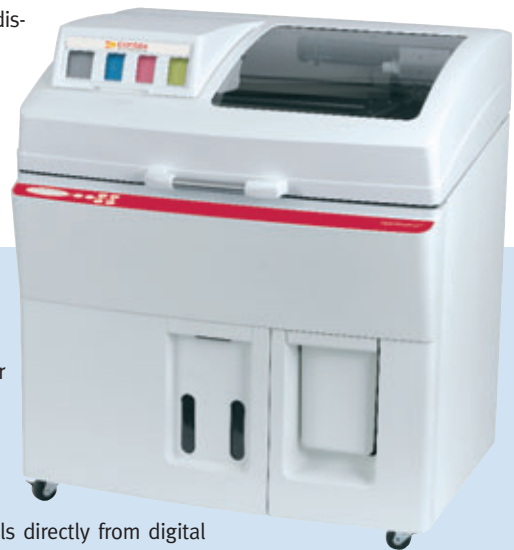
The Contex DESIGNmate Cx 3D printer.

The new Contex printers offer the same features as 3D printers sold by Z Corporation, a Contex subsidiary. The Contex DESIGNmate Cx 3D printer is a full color printer that produces high-definition (600 x 540 dpi) full color 3D models. The Contex DESIGNmate Mx, with a resolution of 300 x 450 dpi, creates physical models directly from digital data. It allows users to produce concept models and functional test parts and is in fact an entry-level prototyping system for office environments and educational institutions, to mention a few target groups. Contex 3D printers are based on proven technology that originated at the Massachusetts Institute of Technology and was later developed by Contex's Z Corporation subsidiary. The technology is sold under the Contex, Z Corporation and Vidar brand names through separate sales channels. Contex 3D printers are available today from dealers worldwide.